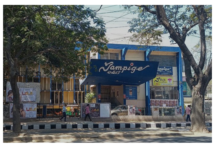
Sampige & Savitha Theatres, Malleshwaram