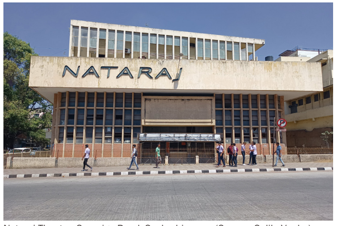
Nataraj Theatre, Sampige Road, Seshadripuram