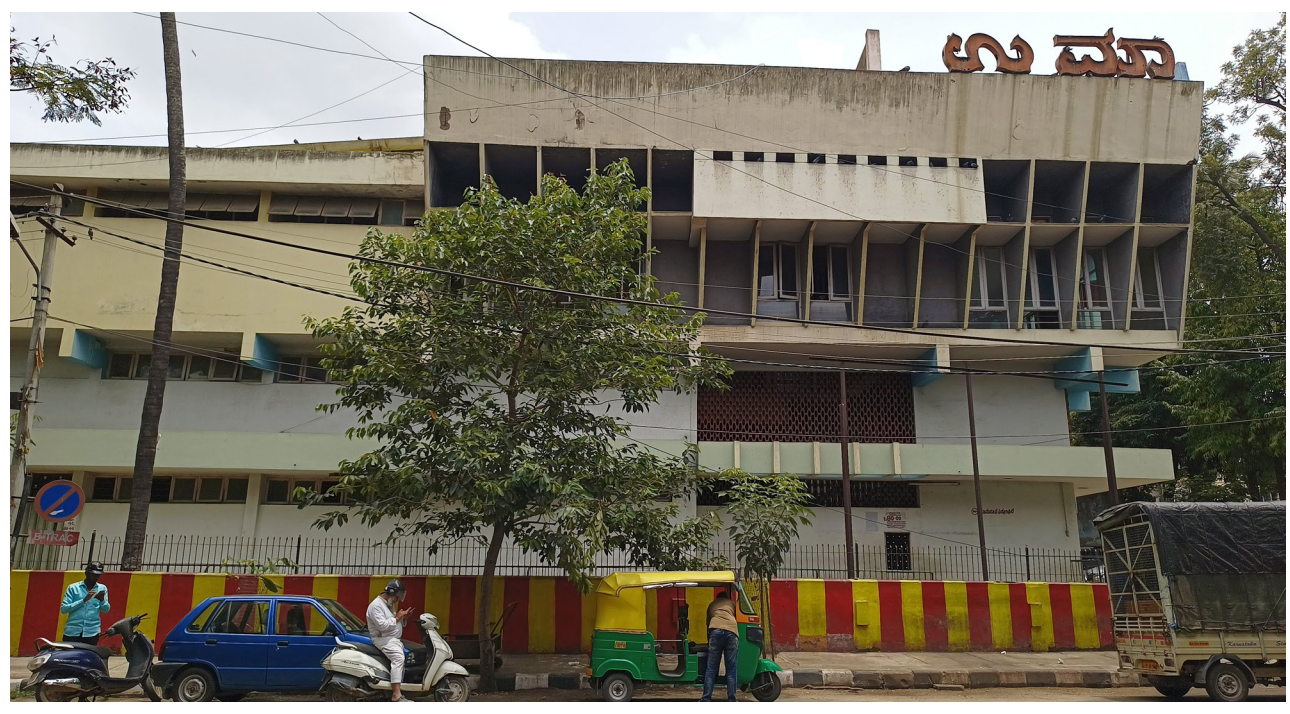
Uma Theatre, Bull Temple Road, Chamarajapete

The forces of time, technology and urbanisation have not been kind to the urban single screen theatre. In our times of multiplex theatres and online streaming platforms, the single screen theatre is rapidly becoming an obsolete and vanishing cultural space in Bengaluru, as in other Indian cities. Dependent on the whims and means of their owners, real estate pressures and fickle audiences spoilt for choice, single screen theatres today are either 'modernising' in appearance and technology, or getting replaced by trending spaces of collective consumption. A selected compilation of pictures taken by invited contributors and RVCA's students and faculty, this photo essay provides glimpses of Bengaluru's iconic single screen theatres - some gone, some still standing alone.