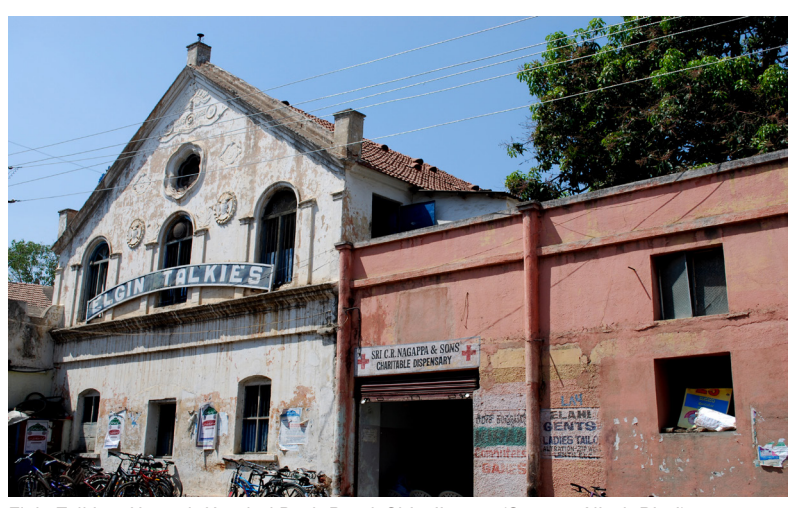
Elgin Talkies, Hazrath Kambal Posh Road, Shivajinagar