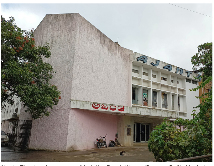
Ajanta Theatre, Annaswamy Mudaliar Road, Ulsoor