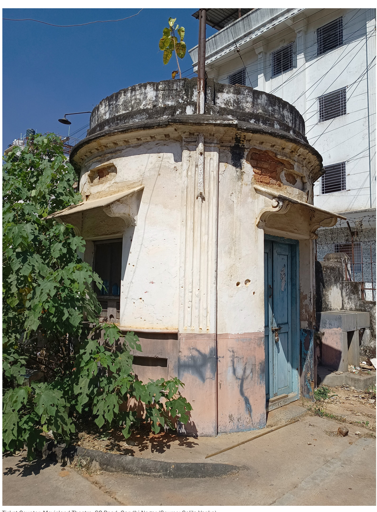
Ticket Counter, Movieland Theatre, SC Road, Gandhi Nagar