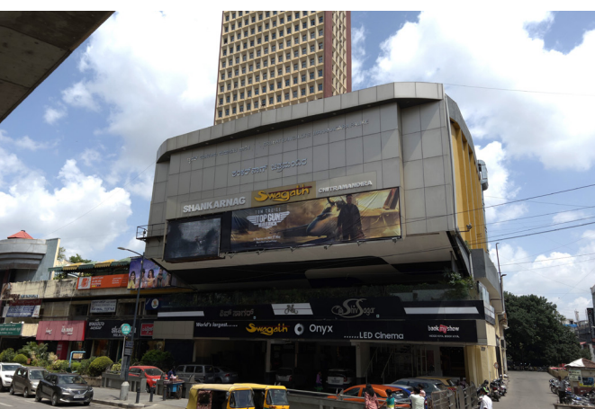
Shankar Nag Swagath Chitramandira, MG Road