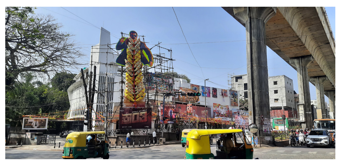
Navrang Theatre, Dr Rajkumar Road, Rajajinagar 2<sup>nd</sup> Block