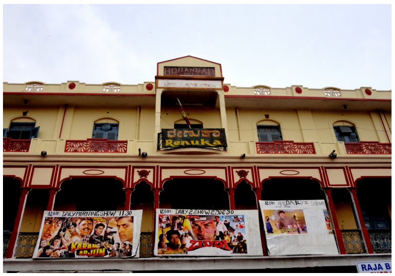
Renuka Theatre, Quadrant Road, Shivajinagar