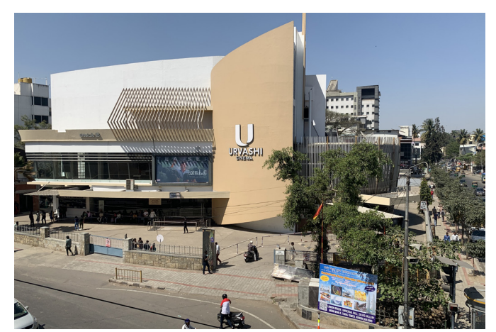
Urvashi Theatre, Doddamavalli, Sudhama Nagar