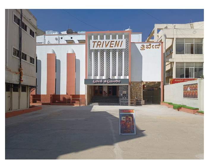
Triveni Theatre, Subedar Chatram Road, Gandhi Nagar Sri Siddeshwara Theatre, JP Nagar 6th Phase