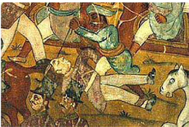
Figures 7 & 8. Scenes from the painting of the Battle of Pollilur