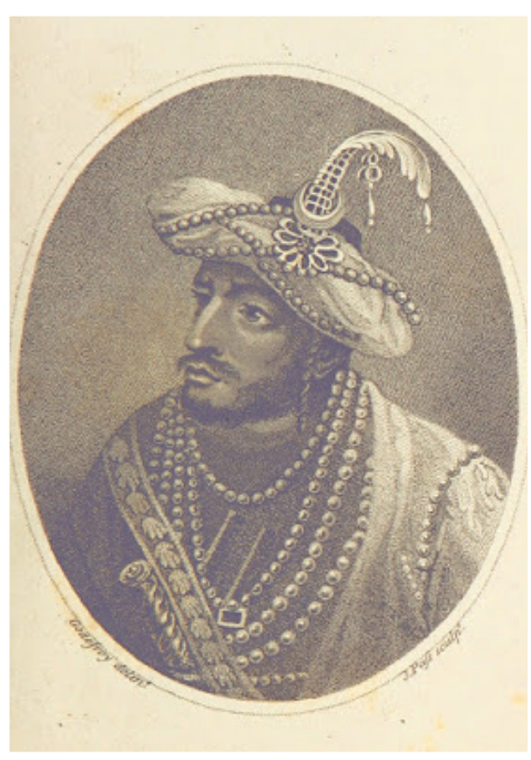
Figures 1 & 2. Two portraits of Tipu Sultan

Army of the Mogul Empire, Revised and Corrected by His Highness Prince Gholam Mohammed [Son of Tipu Sultan]' (Narayan, 2018). While there exist several similar portraits, a more recent claim is that most of these portraits were imagined representations and the only original representation of him is the one published in Thomas Mante's 'The naval and military history of the wars of England, including, the wars of Scotland and Ireland, etc. Vol.V' (Figure 2). While this conjecture would be hard to prove, it is important to note the dichotomy that exists around his representation.