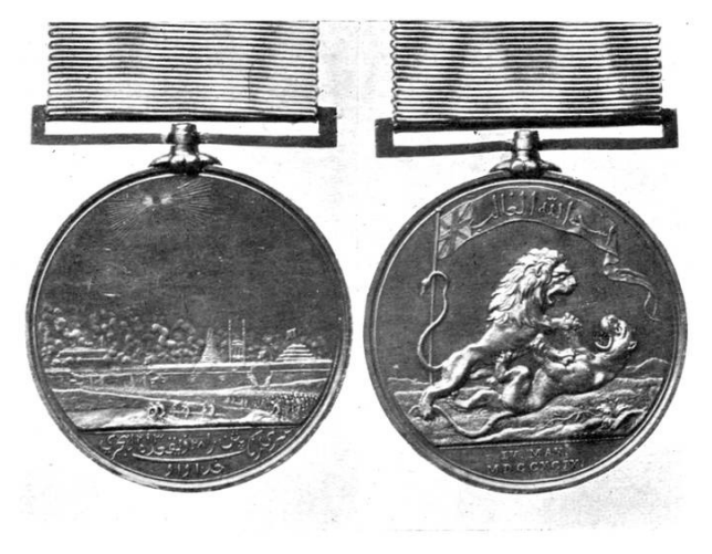
Figure 10. The Seringapatnam medal

Most artworks commissioned after the defeat of Tipu indicate his supporters in a demoralised stance while the British army is depicted in a triumphant stance. The most popular object in the 'loot' from the palace of Seringapatam was Tipu's tiger, a mechanical wooden toy which now rests in the Victoria and Albert Museum, London after two centuries of shifting locations and identities.