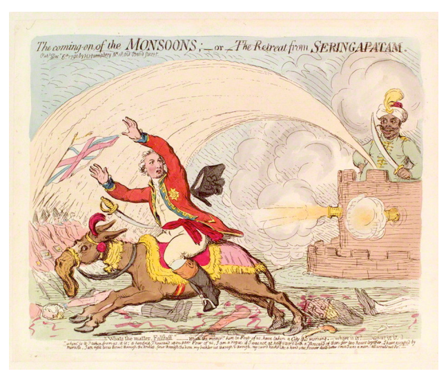
Figure 9. 'The coming of the Monsoons' or 'The Retreat from Seringapatnam'

appearances in cartoons and paintings accessible in London' (2002:220). One such satirical cartoon was 'The coming of the Monsoons' ridiculing Cornwallis after battlefield reversals in India (Figure 9). On one hand, it indicates a fleeing Lord Cornwallis who lost the first Anglo-Mysore War, while also depicting Tipu as a 'tyrant' on the other.