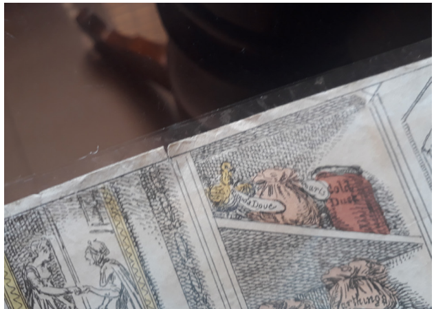
Figures 5 & 6. Royal munificence - hem! by W.N.Jones, June 01,1814