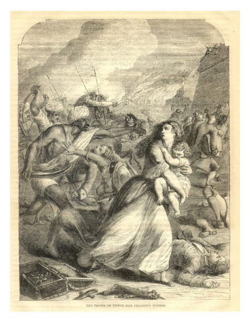
Figure 12. Visual constructs

Seringapatam with the use of Tipu's motto 'Assad Allah El Ghaleb' ('Conquering Lion of God' in Arabic). The production of broadside ballads such as 'The Storming of Seringapatam' at the Royal Coburg Theatre in 1823, in the form of entertainment, fuelled the creation of Tipu's imagined identities (Figure 11). These visual depictions of Tipu as a barbarous tyrant continued to emerge until long after his death as indicated by this engraving from 1861 (Figure 12).