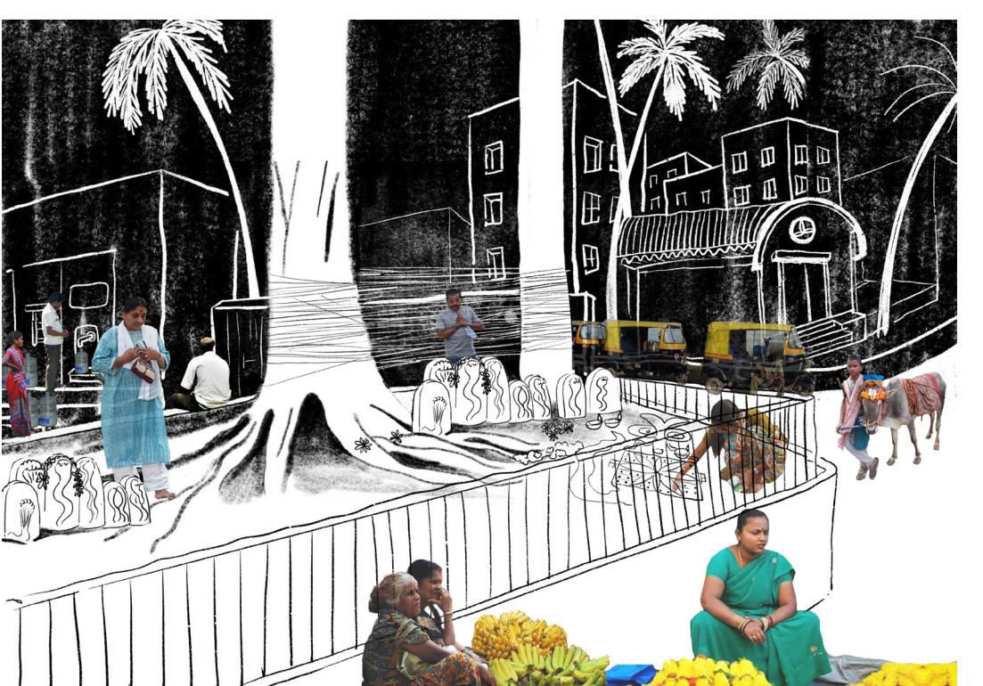
Figure 2. Co-creators