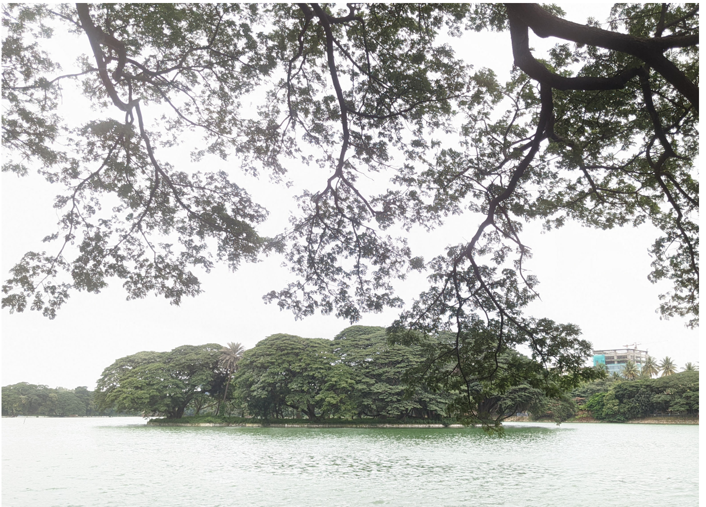
Ulsoor Lake