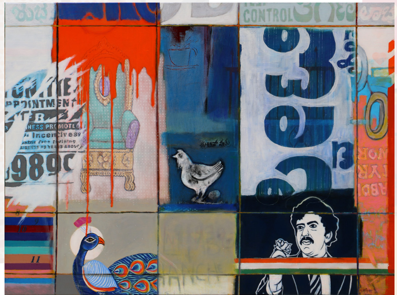
'Traces 21', Oil & Acrylic on Canvas, 36" x 48", 2021