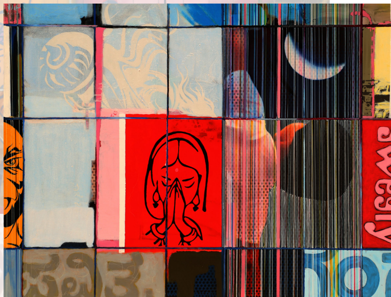
'Traces 5', Oil & Acrylic on Canvas, 36" x 48", 2020