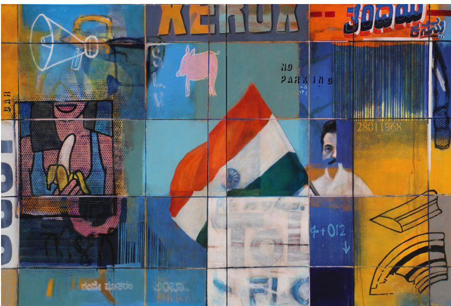
'Traces 15', Oil & Acrylic on Canvas, 48" x 72", 2020