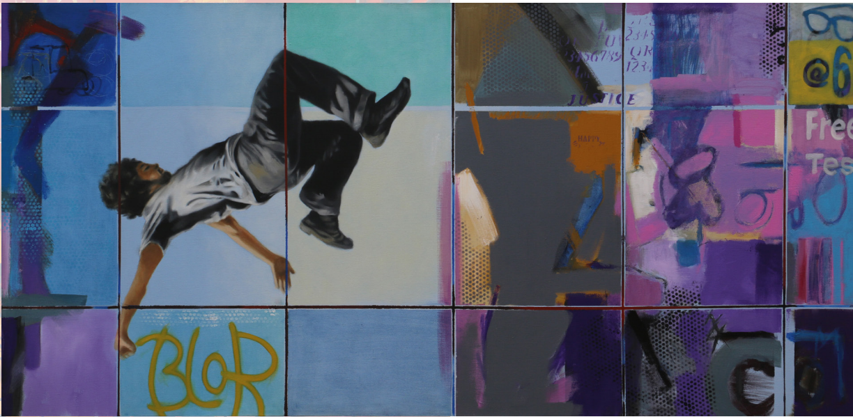
'Traces 3', Oil & Acrylic on Canvas, 30" x 60", 2020