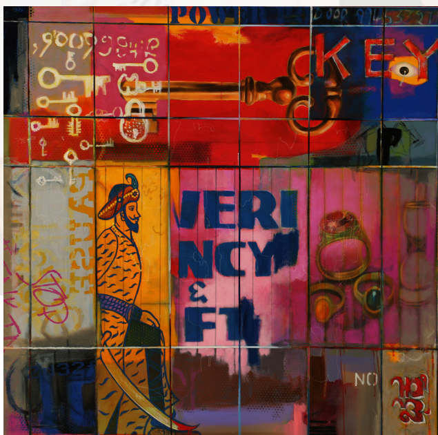
'Traces 7', Oil & Acrylic on Canvas, 48" x 48", 2020

'Gandhi walks away from Johnny Walker Inky ribs lacerate a textbook blue bow-bearing Ram An earthen pot overflows with milk 'KEEP DISTANCE OK' Moist lips open like a Bougainvillea petal Meet the Google God Half-tone traces, Printing errors, Ghosts in the machine 'Dekho Magar Pyar Se'.