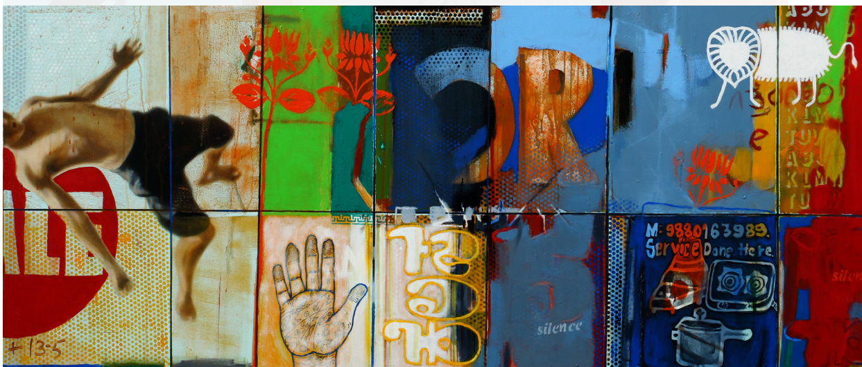
'Traces 2', Oil & Acrylic on Canvas, 30" x 60", 2020

The changing visual culture of Bangalore that I have documented is the source of imagery for this photo essay. Digitally designed and printed posters, banners, signboards are sweeping the city, but hand-painted images have survived in many parts. Similarly hand-painted images on vehicles are seen alongside digitally generated stickers. It is not just image production methods but the changing beliefs, value systems, economic structures and politics that are visible in these images. I have tried to capture the multiple voices and intertextuality that provide rich, nuanced meanings that allude to a layered sense of time. This results in works that are not neatly sorted, orderly and simple but a complex imagery almost on the edge of chaos which creates 'The Unruly Syntax'.