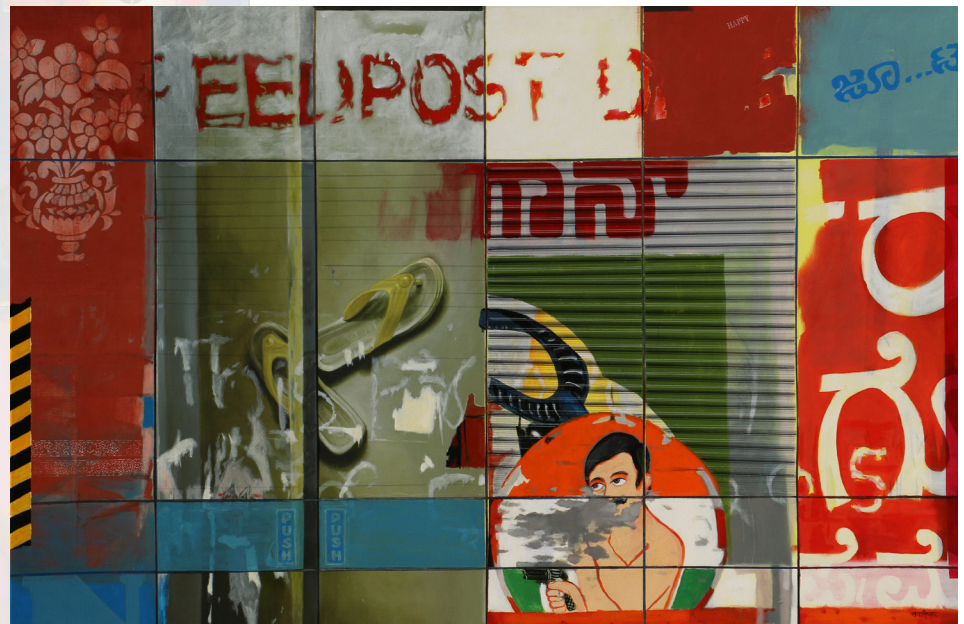
'Traces 20', Oil and Acrylic on Canvas, 48" x 72", 2021