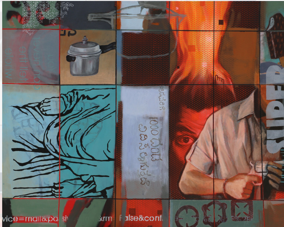
'Traces 16', Oil & Acrylic on Canvas, 48" x 60", 2020