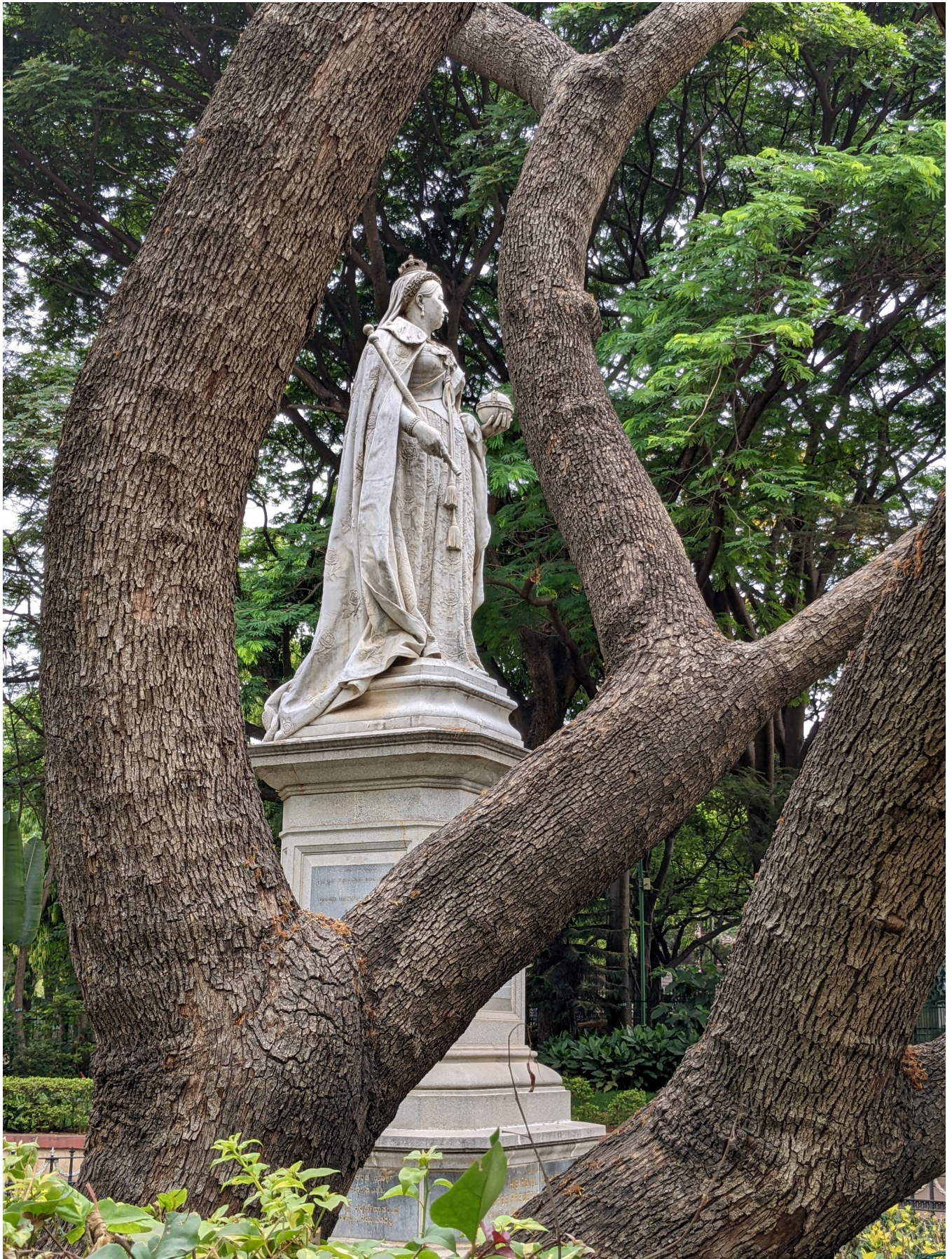
Statue of Queen Victoria, Cubbon Park