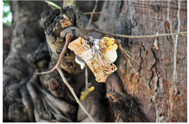
Sacred thread tied around trees as a mark of veneration