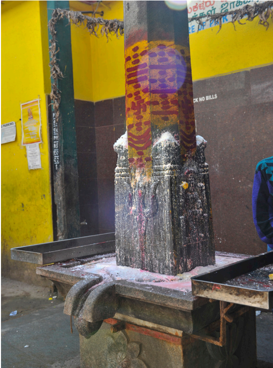
Symbolic offerings of salt, turmeric and vermillion at the entrance to the shrine