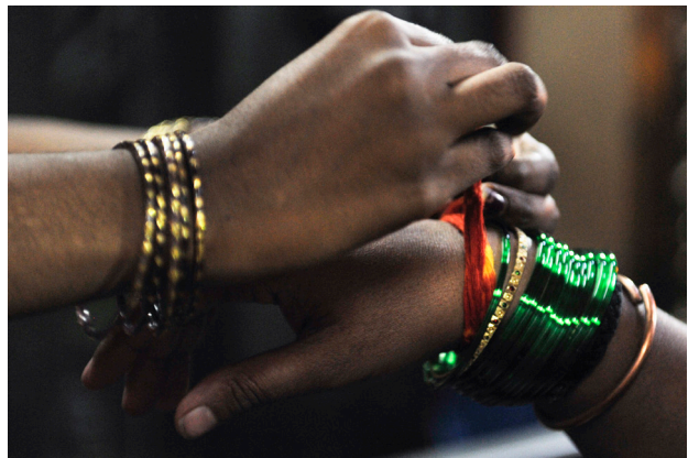
Devotees take home votive objects such as the thread and bangles as a mark of her protection