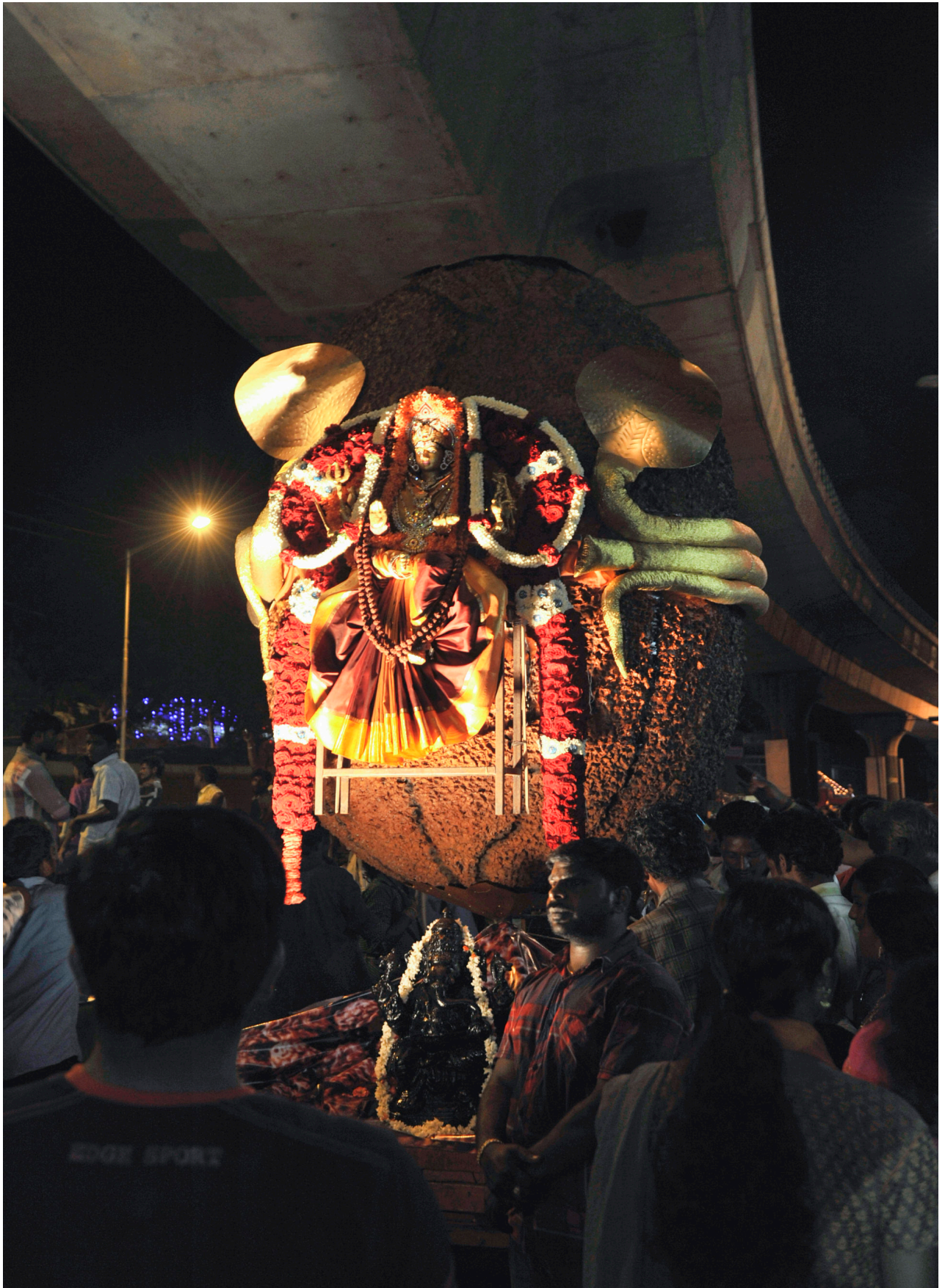
Several rural deities from neighbouring shrines in the Ulsoor area and beyond, are brought to the city to witness the divine nuptials between Lord Shiva as Someshwara and his consort Kamakshi, during the Ulsoor Poo Pallakki (flower palanquin) festival. They sit here juxtaposed against the Metro line as reminder that the rural will continue to find its own place in the urban