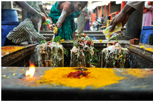
Devotees offer curds and other 'cooling' substances such as lemons, neem leaves and turmeric to the Goddess Bisilu-Mariamman who is placed at the entrance of Sri-Annamadevi's shrine in the Majestic area