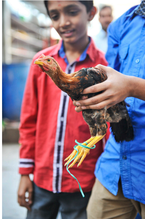
Traditionally, livestock and fowl were once offered as a gift to the Goddess to appease her or seek her blessings