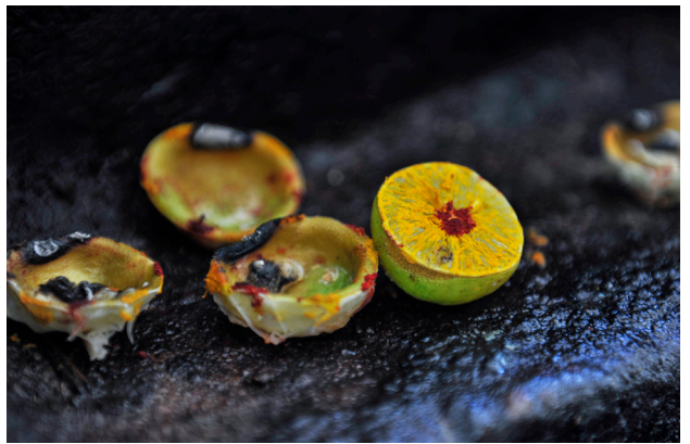
Lemons are powerful votive offerings because they are considered to have properties that are essential to maintaining good health