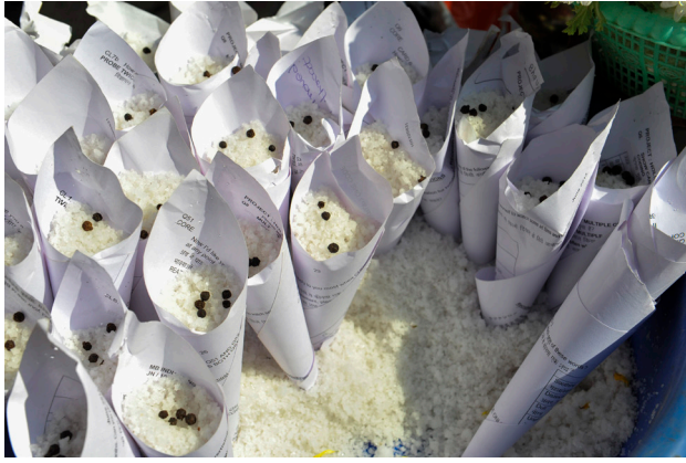
Peppercorn packets are often stashed at the entrance of a shrine and bought by devotees as an offering to the Goddess whose blessings are as powerful as her wrath