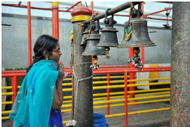
The Grama devate and devis are solicited for the wellbeing of the home, happy marriages and healthy children