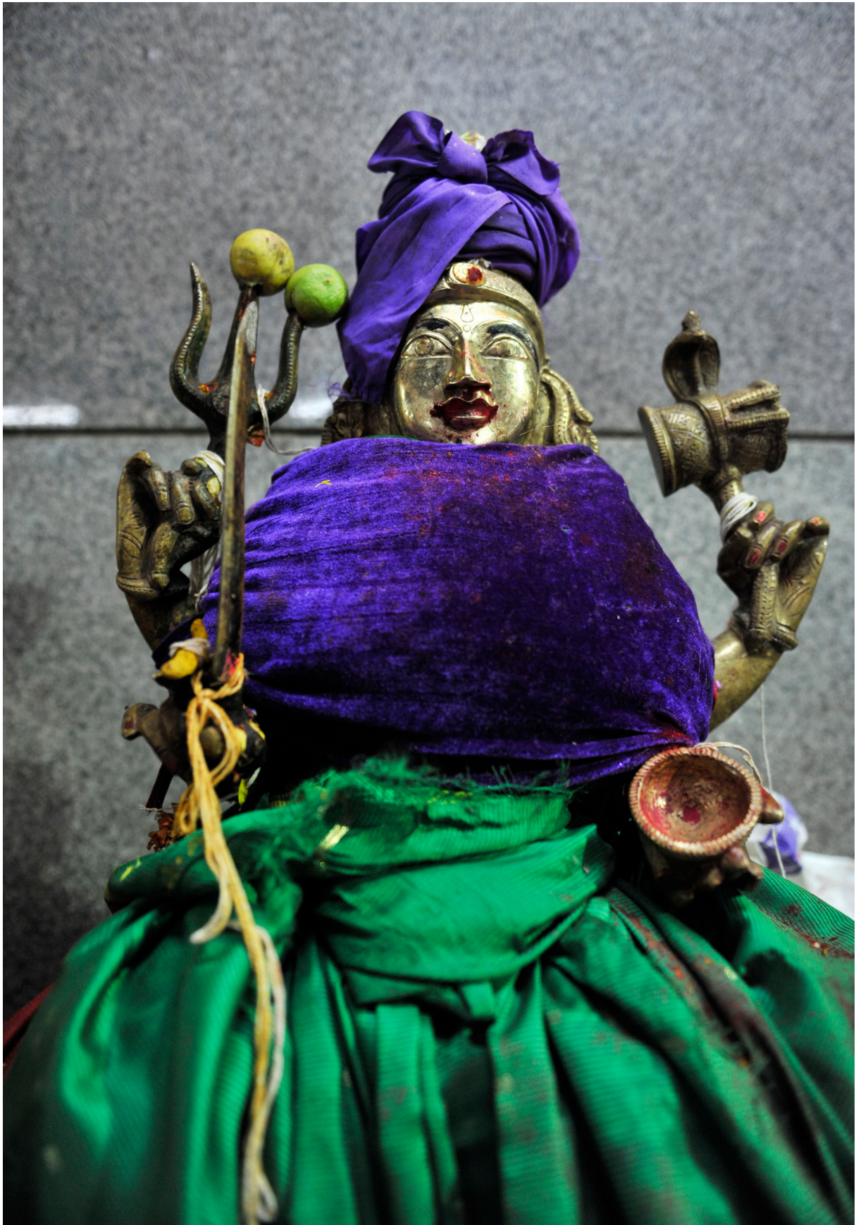
The Goddess is also seen with the trident, a symbol of her feminine power and energy. The bowl in her hand positions her as a nourisher-nurturer