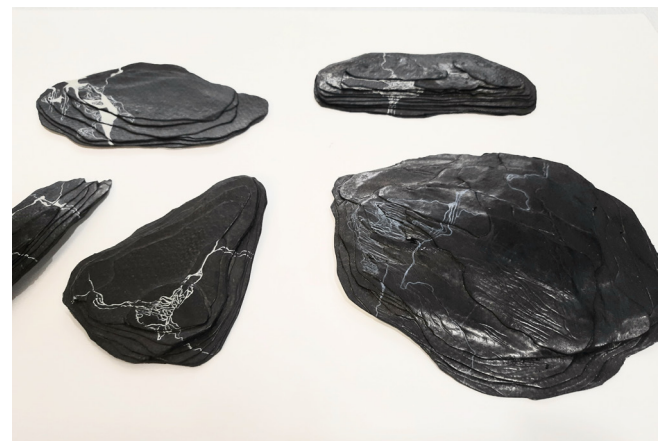
Figure 6. Detail of a stone from the series Fragments of Earth (1) , mixed media with ink, metal dust, scrap metal and resin, " 9.5" x 7" x 2", 2018