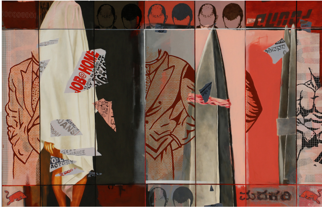
'Traces 8', Oil & Acrylic on Canvas, 48" x 72", 2020