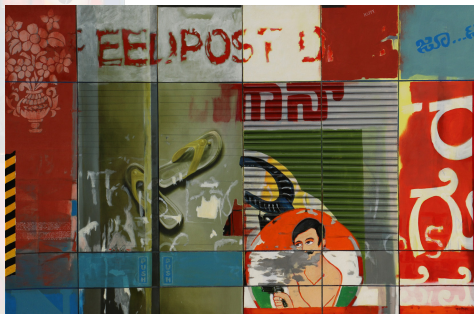
'Traces 20', Oil and Acrylic on Canvas, 48" x 72", 2021