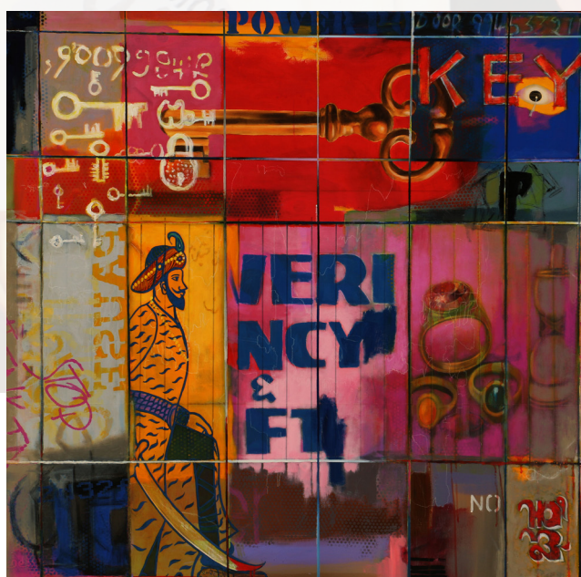
'Traces 7', Oil & Acrylic on Canvas, 48" x 48", 2020

'Gandhi walks away from Johnny Walker Inky ribs lacerate a textbook blue bow-bearing Ram An earthen pot overflows with milk 'KEEP DISTANCE OK' Moist lips open like a Bougainvillea petal Meet the Google God Half-tone traces, Printing errors, Ghosts in the machine 'Dekho Magar Pyar Se'.