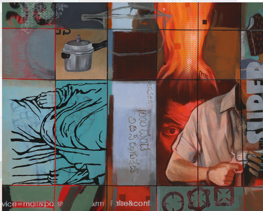
'Traces 16', Oil & Acrylic on Canvas, 48" x 60", 2020