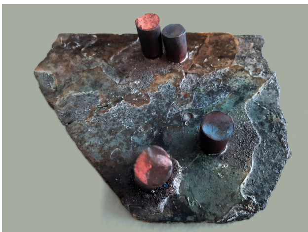
Figure 6. Detail of a stone from the series Fragments of Earth (1), mixed media with ink, metal dust, scrap metal and resin, " 9.5" x 7" x 2", 2018