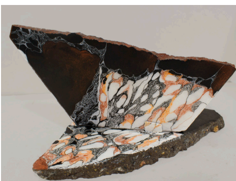
Figure 2. Fragments (2), mixed media painting with casted concrete, bronze oil pigment and resin, 9"x11.5"x1", 2022