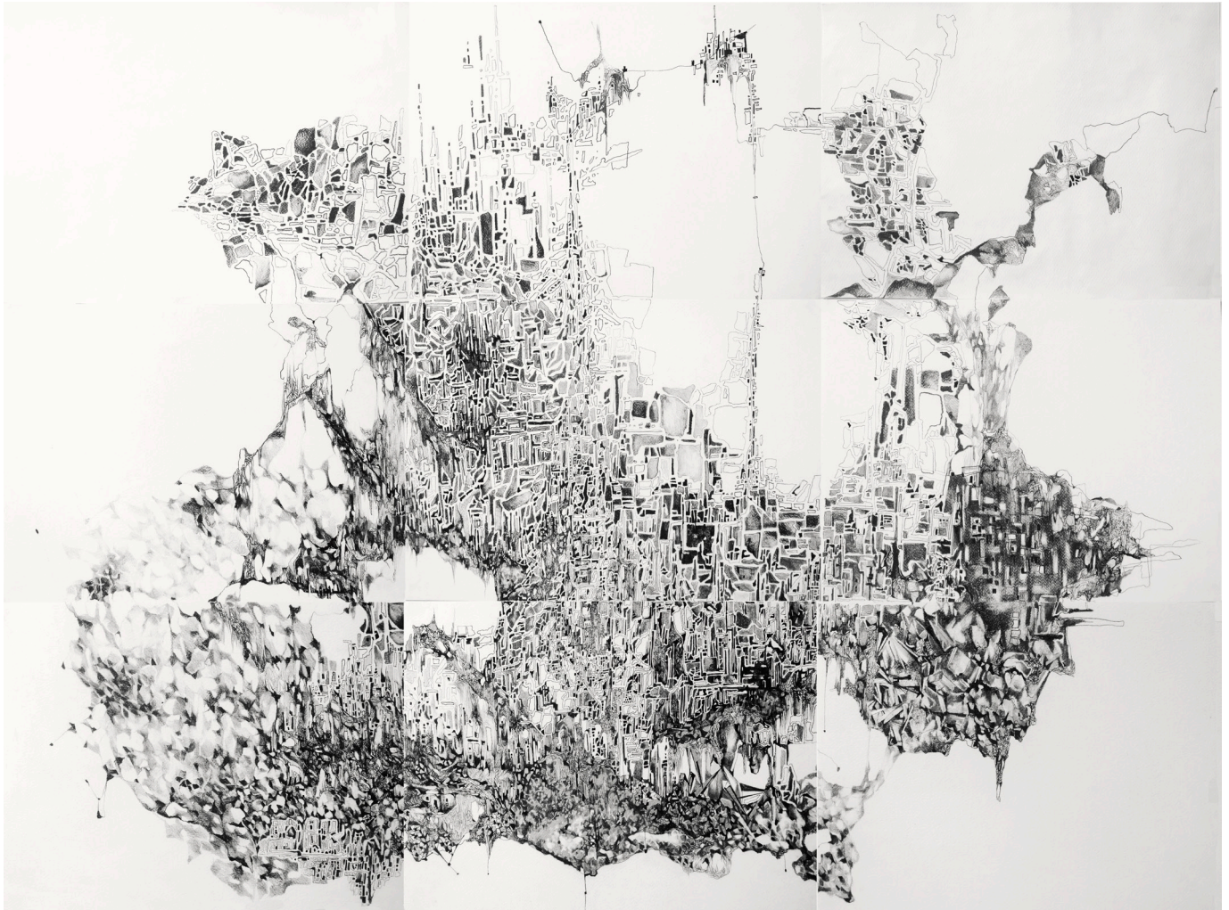
Figure 10. In Between the Nooks & Crannies , mixed media drawing on paper, 48" x 36," (9 panels), 2020