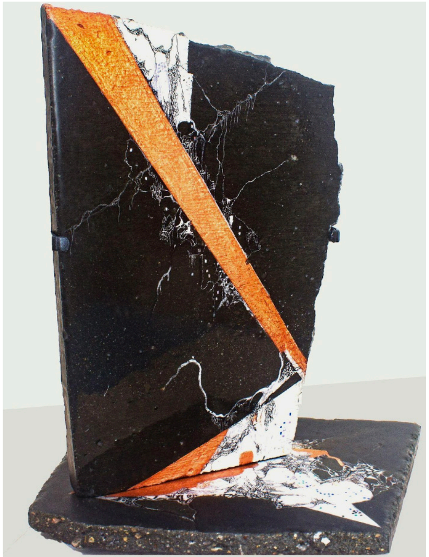
Figure 1. Fragments (1) , mixed media painting with casted concrete, copper leaf and resin," 12" x 9" x 14", 2022

Deep Map is a term that William Least Heat-Moon (1991) in his book 'PrairyErth: A Deep Map' coined for multiple ways of perceiving a place through all its layers. Using the method of deep mapping, I explore layered narratives that are specific to actual geographical areas. My work merges the multiple metropolises I have inhabited, and is rearranged in diverse configurations, making it adaptable to multiple ways of seeing. In doing so, I build connections with complex and unforgiving materials to create composite works that call for speculation and reflection.