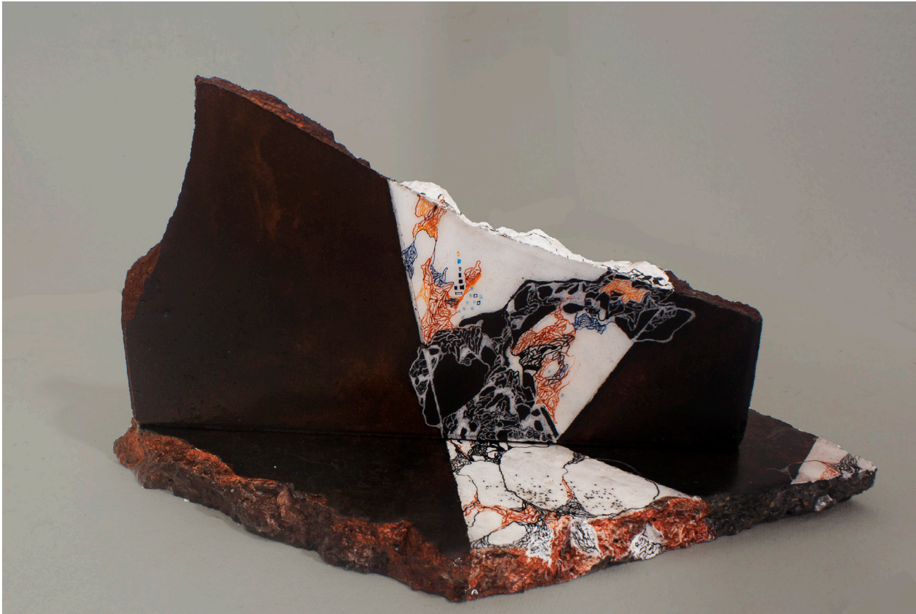
Figure 4. Fragmented Landscapes (2) , mixed media painting and metal dust on casted concrete, roofing terracotta tiles and resin, 9" x 9" x 7" x 1", 2022

Organic forms of drawing that flow across the surfaces are derived from studies of decaying material that I developed while visiting dumping grounds and seeing piles of rubbish lying in heaps by the side of the road, that now seep through all of my works forming stylised patterns of unrecognisable traces of material objects, that fuse into the natural landscapes creating new terrains.