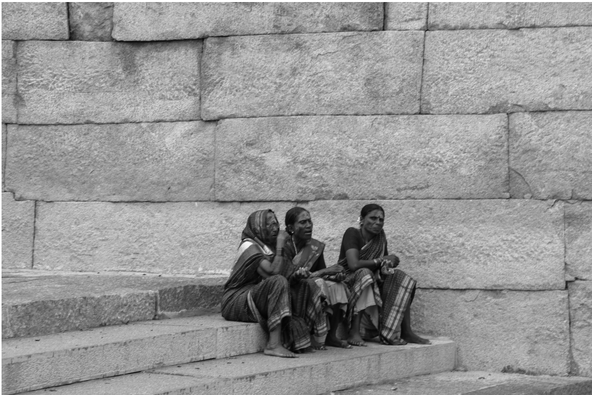
Three Women, One Wall of Time A quiet pause carved into stone—where stories sit, and silence speaks louder than words. Location: Hampi

These images document lives not often in the spotlight but deeply rooted in culture, resilience, and change. Together, they form a tapestry of subcultures - geographies of labor, craft, and emotion - woven into the everyday fabric of the region.