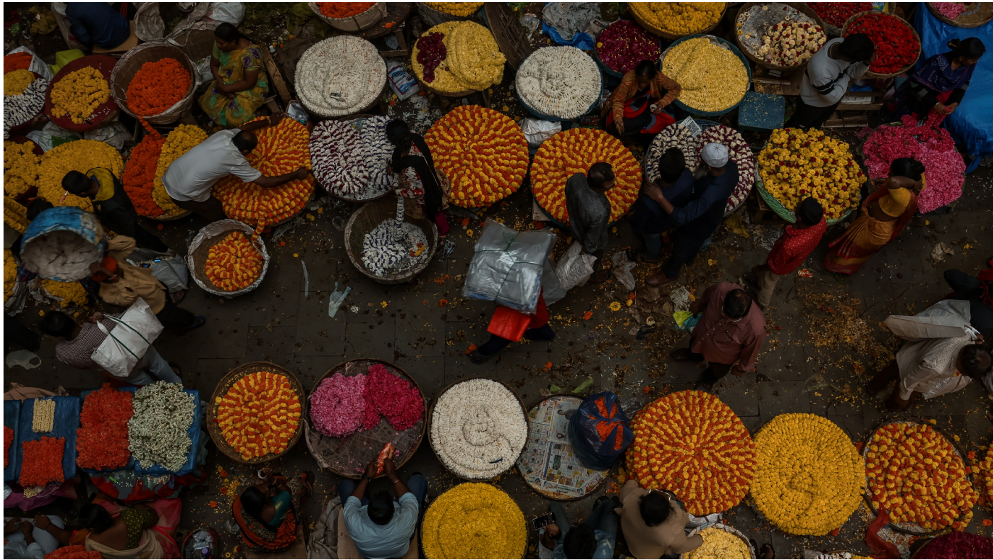
A floral mosaic of color and motion—where tradition bursts into commerce and culture collides in scent and sound. Location: kr Market