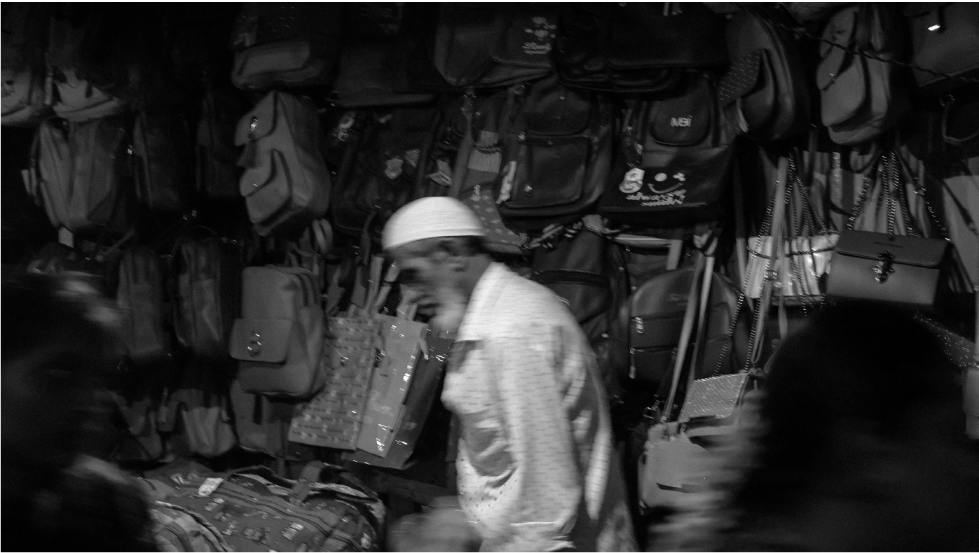
Faces of the Market Between the bags and bustle he moves, a rhythm the old city quietly proves. Location:Devaraj Urs Market, Mysore