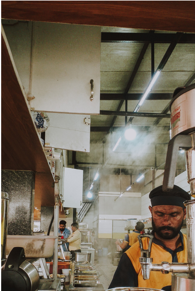
(bottom) Flames Feed Families, Not Just Plates. Man cooking in a hot kitchen In this picture, a man is working in a busy kitchen, surrounded by steam and heat. He looks focused, and we can feel the hard work he puts into every dish. He isn't just making food — he's working to support his family and help others. This photo shows us the effort and care that goes into something as simple as a meal, and how much it means for those who do it every day. Location: Hotel Sri Krishna Dwaraka, Chikkegowdanapalya, Bengaluru.