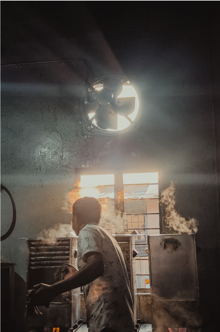
Bidadi’s Dawn Not just steam, but stories rise in quiet kitchens where effort lies. A man, a rhythm, a morning rite etched in warmth and filtered light. Location: Bidadi