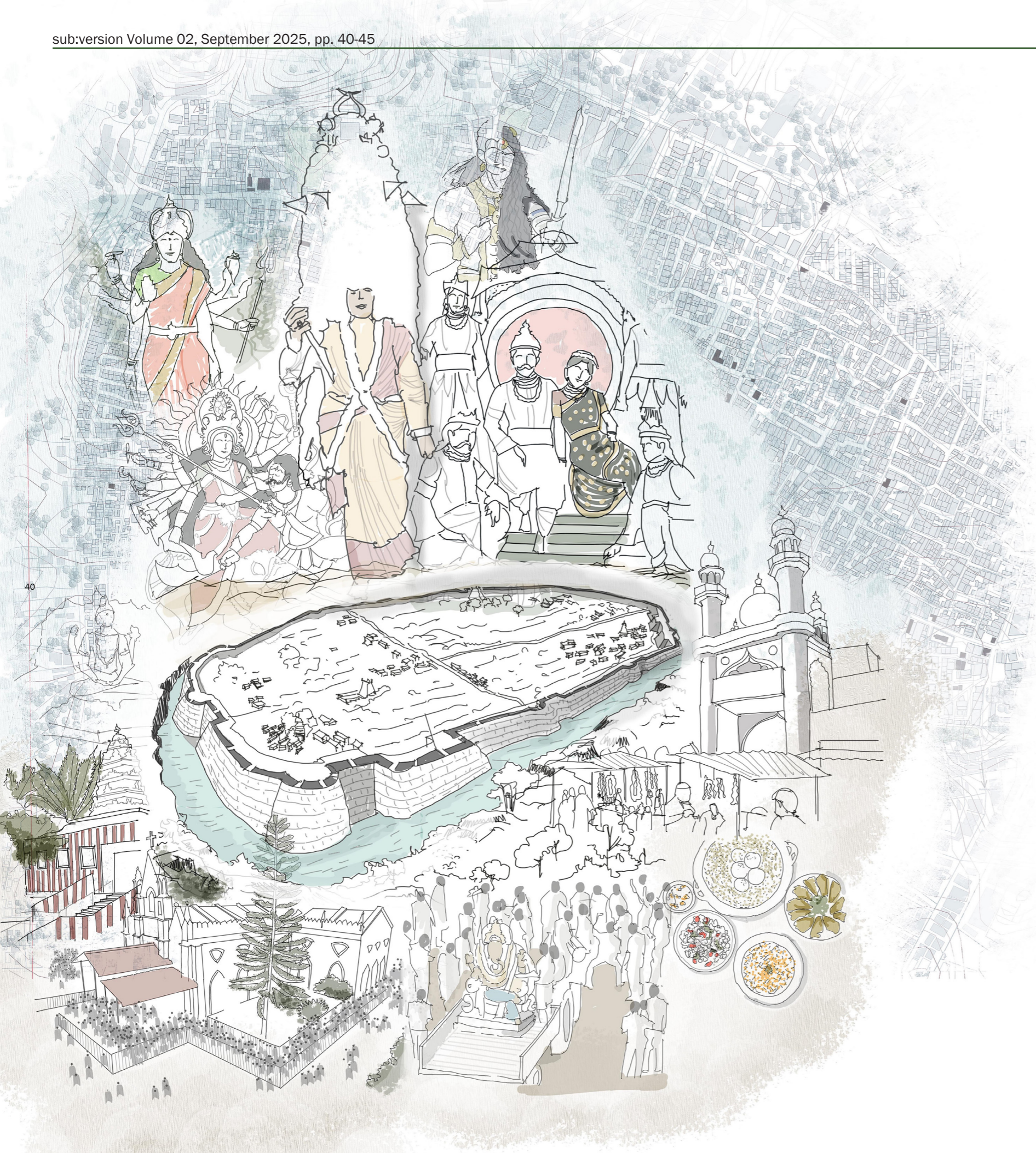
Collective memory of Chickpete area, Bengaluru

Embodied place-making can thus be considered to be the primary mode by which individuals, societies, and social systems reproduce themselves. Scholars such