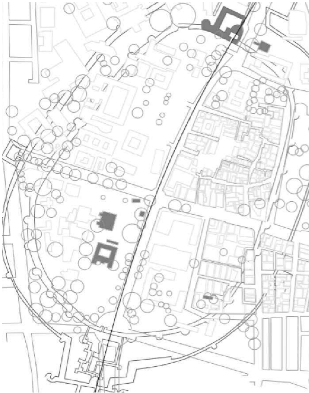
Figure 2. Overlay of Bangalore Fort on the contemporary city reflects the urban artefacts' resilience.

became the new language of the city. The modernist polycentric approach heightened the segregation between the native and the new extensions, and there arose the conflict between historicism and modernism.