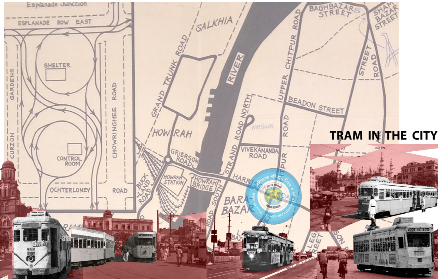
TRAM IN THE CITY

Kolkata's trams are at a crossroads, embodying a delicate balance between past and future. Revitalizing the tram system involves more than just updating infrastructure; it requires honoring the emotional, historical, and cultural significance trams hold for Kolkatans. Planners and policymakers face the challenge of modernizing while retaining the community spirit and heritage trams inspire. The vision is not just to preserve the past, but to craft a sustainable future where tradition and modernity coexist.