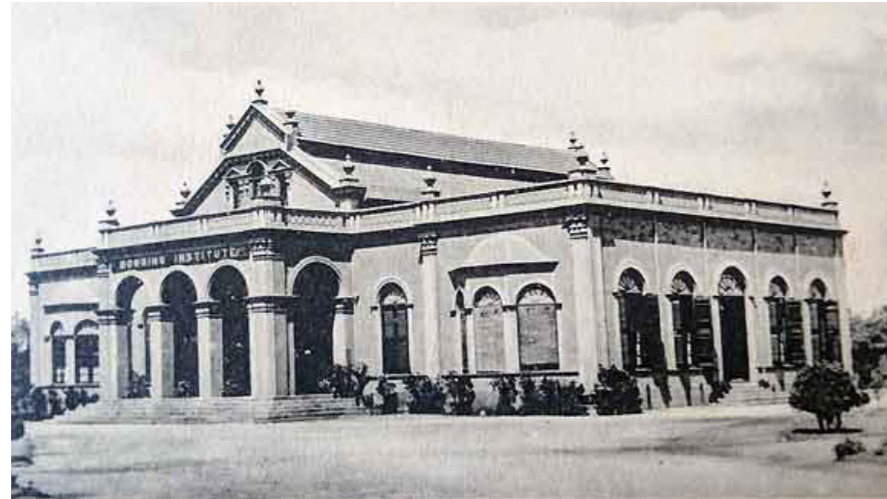
Sheshadri Iyer Memorial Library

down an evil dictator or two, moulded through considerable heavy lifting done under the incessant orchestra of chirping and squeaking of little birds & squirrels of Bangalore compounds.