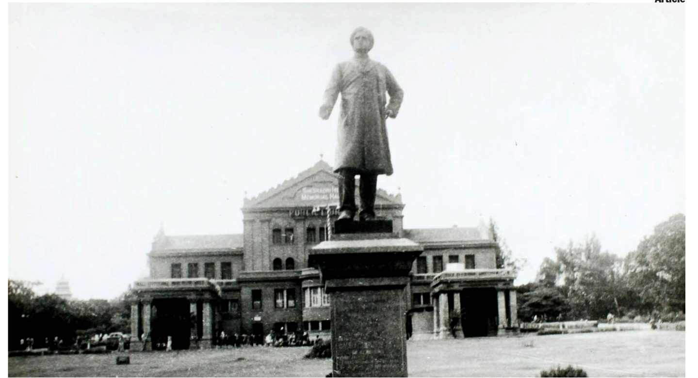
Bowring Institute, Bengaluru

This easily moth eaten European invention of communication came to Indian shores hidden in the racks of those merchant ships like mice in a ship's dirty lower decks. The Indians of the yore didn't take to this inexplicable import instantly, being suspicious of its true intentions but by & by took an earnest interest as they probably suspected it might contain the secret to the white man's craftiness.