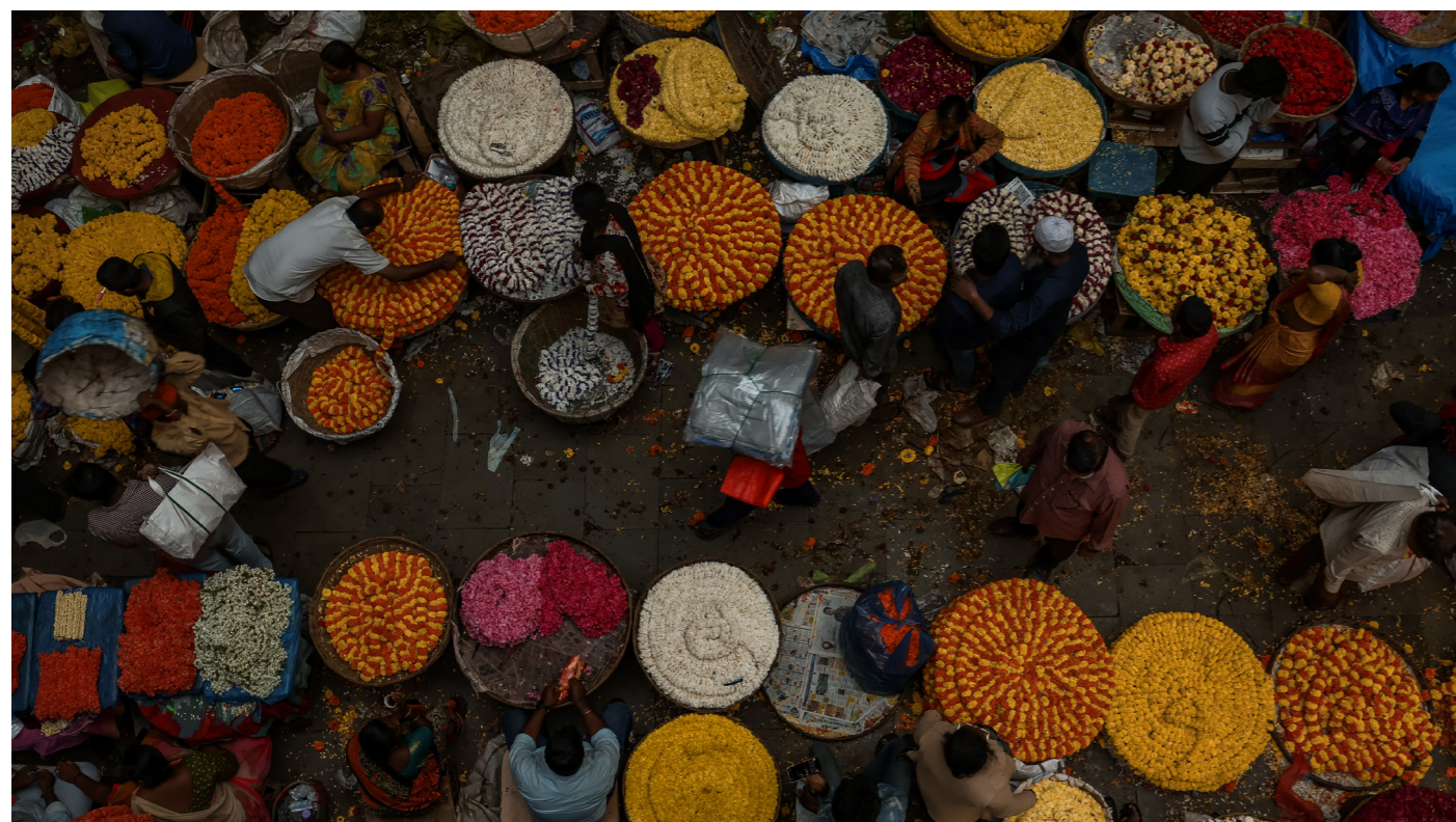
A floral mosaic of color and motion—where tradition bursts into commerce and culture collides in scent and sound. Location: kr Market