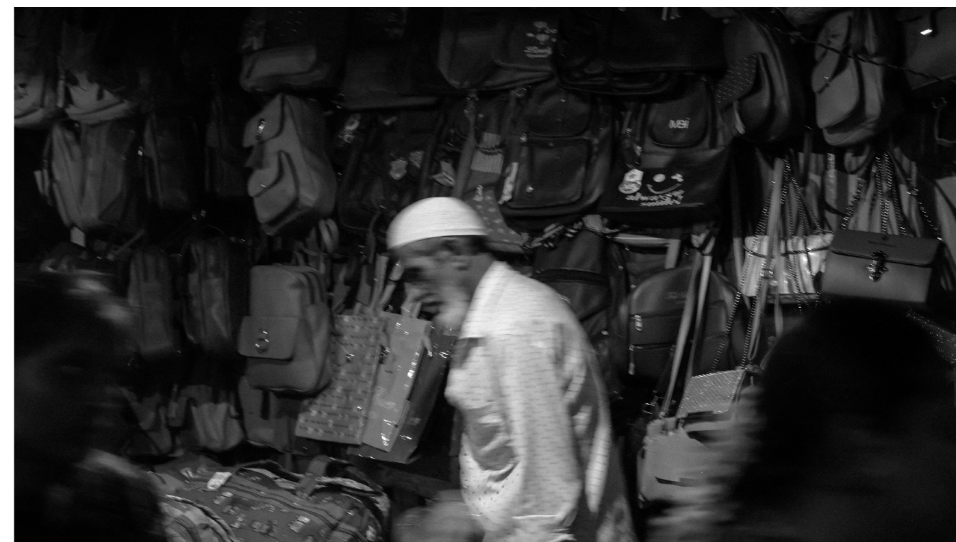
Faces of the Market Between the bags and bustle he moves, a rhythm the old city quietly proves. Location:Devaraj Urs Market, Mysore