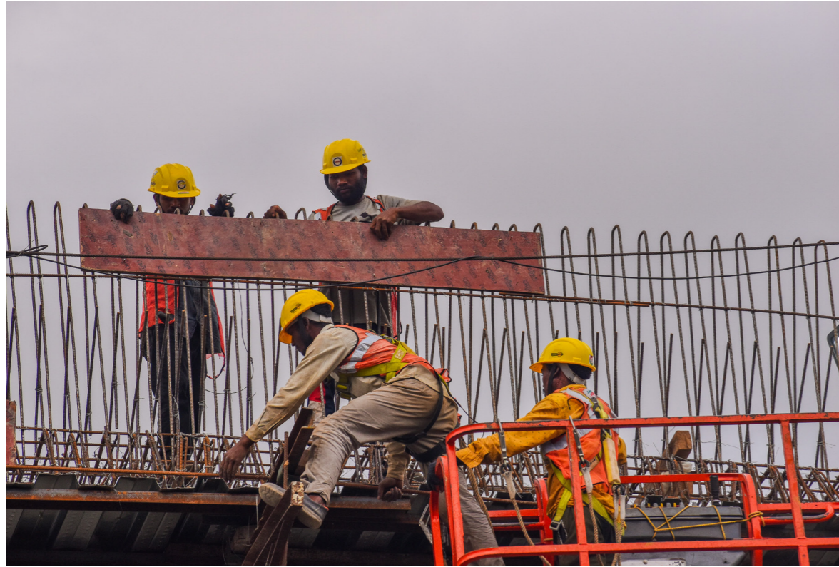
Building the future – one beam, one hand, one hope at a time. This photo captures the silent strength behind urban development, the workers building Bengaluru's metro. It shows the hard work, teamwork, and dedication of those who shape the city's future from the ground up. These workers may remain unnamed, but their efforts lay the foundation for millions of daily journeys. It's a powerful reminder of how cities rise through the hands of everyday heroes.

Location: Bengaluru Metro Route Construction Site