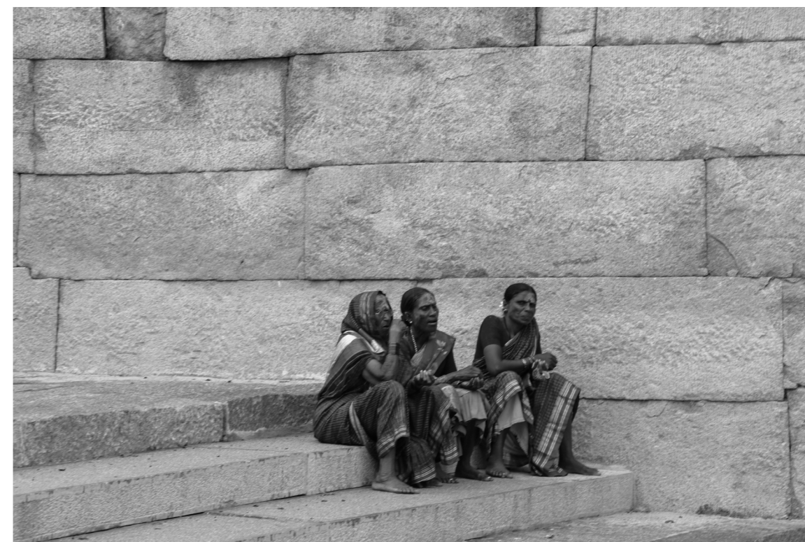
Three Women, One Wall of Time A quiet pause carved into stone—where stories sit, and silence speaks louder than words. Location: Hampi

These images document lives not often in the spotlight but deeply rooted in culture, resilience, and change. Together, they form a tapestry of subcultures - geographies of labor, craft, and emotion - woven into the everyday fabric of the region.