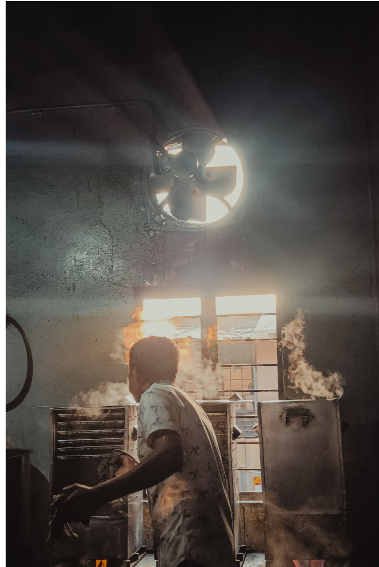
Bidadi's Dawn Not just steam, but stories rise in quiet kitchens where effort lies. A man, a rhythm, a morning rite etched in warmth and filtered light. Location: Bidadi