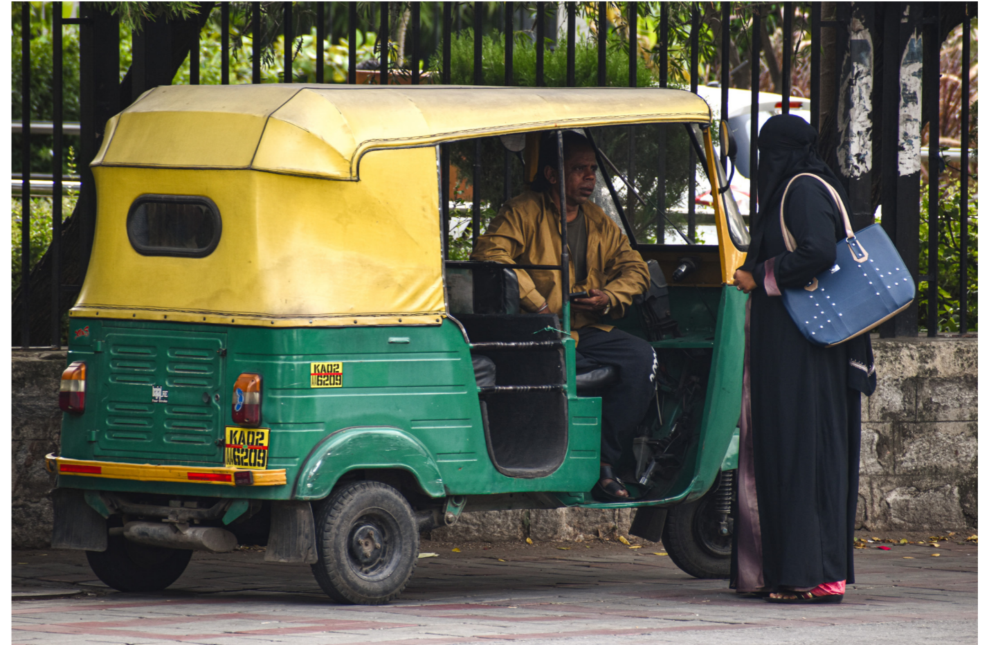
Moments in motion – a pause between the city's rhythm. This photo captures a quiet moment in the busy life of Bengaluru. It shows the everyday routine of city commuters, reflecting the rhythm of urban life. The lighting, expressions, and backdrop highlight the contrast between movement and stillness, giving a powerful yet simple glimpse into the life of a working city.

Location: Shantinagar Bus Station, Bengaluru