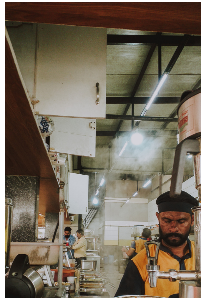
(bottom) Flames Feed Families, Not Just Plates. Man cooking in a hot kitchen In this picture, a man is working in a busy kitchen, surrounded by steam and heat. He looks focused, and we can feel the hard work he puts into every dish. He isn't just making food — he's working to support his family and help others. This photo shows us the effort and care that goes into something as simple as a meal, and how much it means for those who do it every day. Location: Hotel Sri Krishna Dwaraka,Chikkegowdanapalya,Bengaluru.