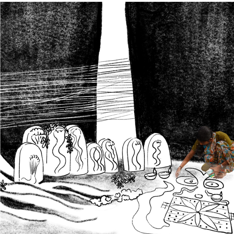
Figures 5 & 6. Giving rather than extracting