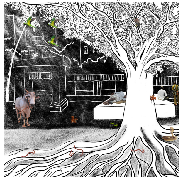
Figure 3. Ecosystem