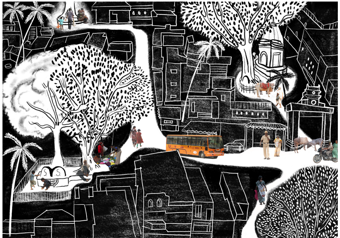
Figure 1. Product and Producer

'To speak of the commons as if it were (only) a natural resource is misleading at best and dangerous at worst - the commons is an activity and if anything, it expresses relationships in society that are inseparable from relationships to nature. It might be better to keep the word as a verb, an activity (or process), rather than as a noun, a substantive' (Linebaugh 2008:279). Hence, the